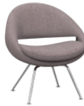
Ariane 1.2 LB