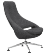
Ariane 1.1 HB