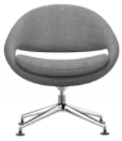
Ariane 1.1 LB