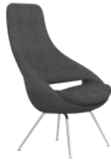
Ariane 1.2 HB