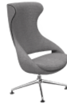
Ariane 1.1 WB