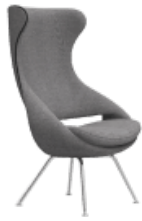
Ariane 1.2 WB