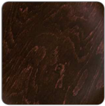
WENGÉ STAINED BEECH