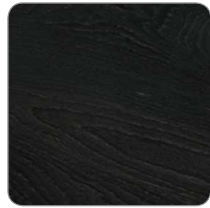
BLACK STAINED BEECH