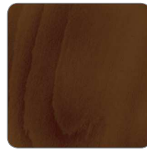
WALNUT STAINED BEECH