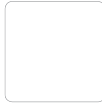
STAINED ACCORDING TO SAMPLE