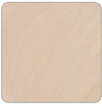
MAPLE STAINED BEECH